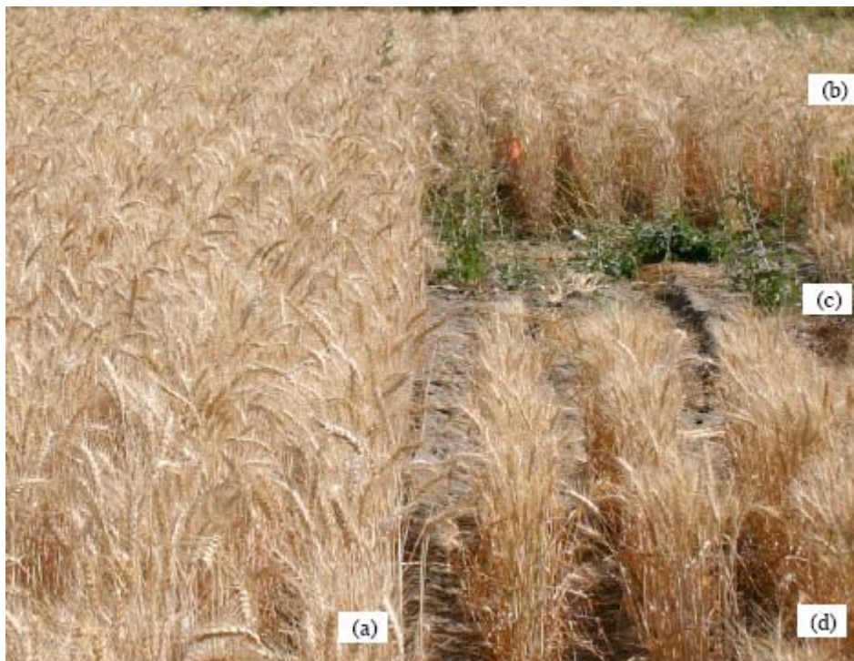
Figure 3: Field evaluation of Clearfield KCF08001 and KCF08002 lines with checks grown in the Spillman Farm after 5X spray with ‘Beyond’; (a) ‘KCF08001’ two gene Clearfield resistance line. (b) ‘KCF08002’ two gene Clearfield resistance line. (c) ‘Rod’ Clearfield susceptible variety used as a control. (d) ‘ORCF-101’ one gene Clearfield resistance line.

(3). Clearfield KCF08001 and KCF08002 lines: Progeny of two of the eight plants from the Rod × CL0618 cross (see previous section) was very uniform for the herbicide resistance as well as for height and other phenotypic traits Figure 3. DNA analysis of few random plants from this progeny confirmed presence of two gene Clearfield in all tested plants. After removing the off type plants harvested from the progeny was tested for quality. These lines do not have acceptable level of quality but the yield and other agronomic traits are very good. These two lines are currently in the WSU variety testing program. We expect these two lines to serve as germplasm for our future Clearfield transfers and for forward breeding program (see progress report for project 3019-7450)